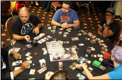
"Hey, those are my people!"

When you think of board gaming at Dragon Con, what do you picture? A room full of people involved in animated conversations and intense decision making? Tables full of game boards, cards, dice, tokens, manuals, and miniatures?